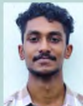
ROMO ROY R NIPPON TOYOTA