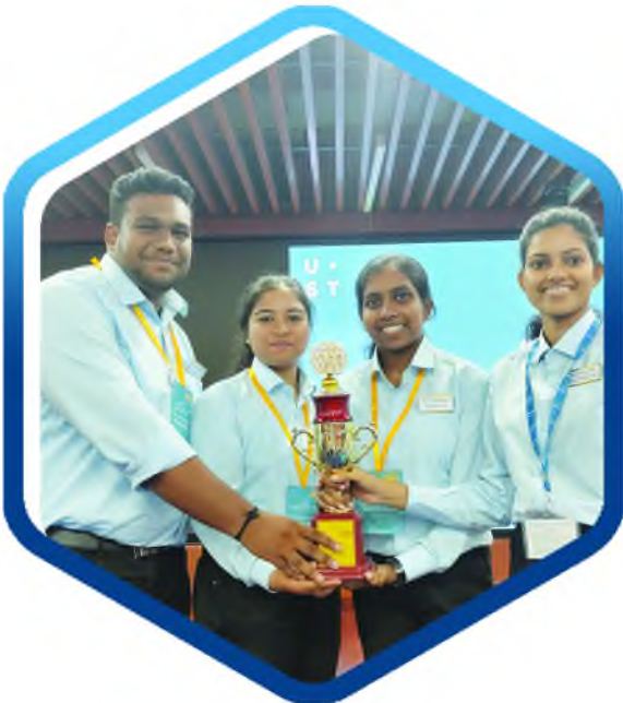
TRINITY'S WINNING TEAM AT UST'S INTERCOLLEGE PROJECT COMPETITION